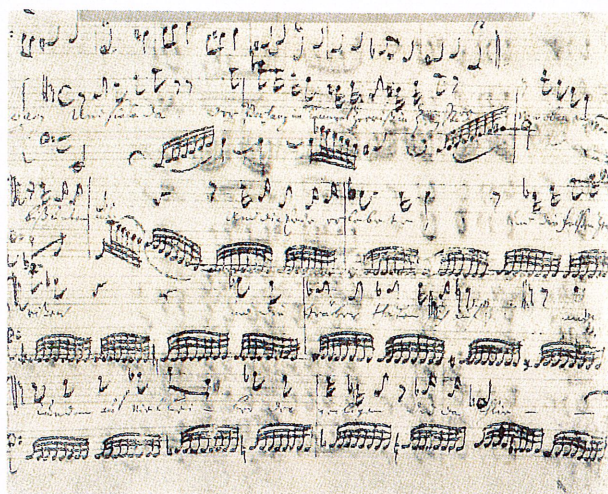
ABOVE: A page from the manuscript score of Bach's St Matthew Passion, first performed in Leipzig on Good Friday in 1729.

Bach's years at Leipzig, where he was required not only to teach, but to supply music for the town's two principal churches, St Thomas and St Nicholas, were relatively uneventful, but were punctuated by acrimonious disagreements with the council over pay and conditions. Nonetheless, they were amazingly fruitful. One of his principal jobs was to write, rehearse and direct cantatas for the Sunday services at the two churches, and his output included around 250 of these substantial works for voices, chorus